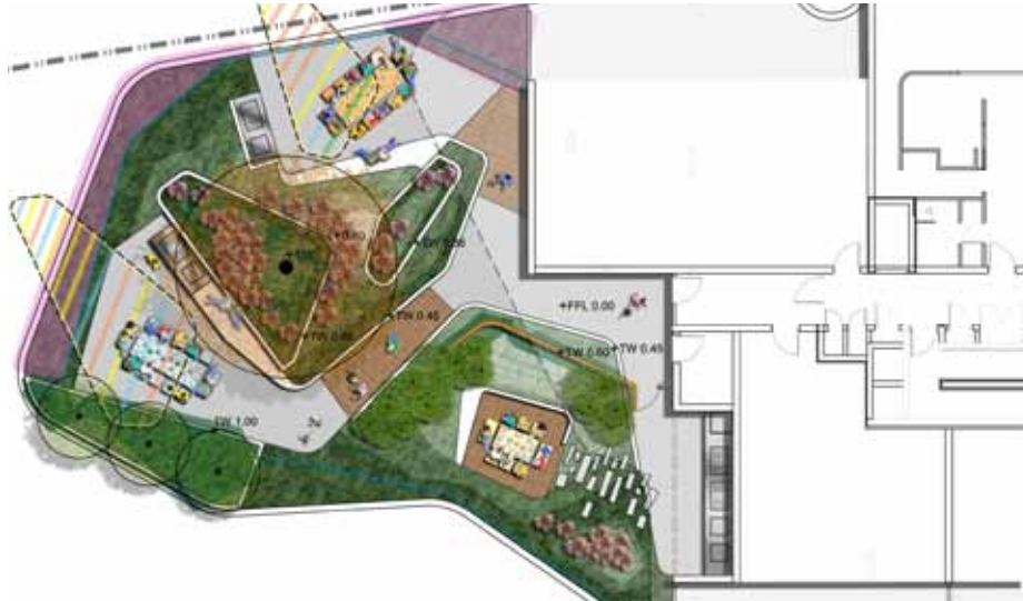
Level 6 private communal areas

Complementing the level 3 outdoor leisure areas the level 6 area adds a private dining experience. Three fully separated large party dining areas each with their own cooking and outdoor kitchen facilities. Each designed to bring a different experience and set of views. A ground plane defined with textured concrete and flush timber landings, framed by fine curving in situ concrete walls layered and filled with interesting planting. A combination of raised planters, planting and timber panels ensures each area is completely separated from the next while maintaining a view experience for each area. A balustrade system is set out to fulfil safety requirements while bringing interest and accommodating a 'cascade planting' of native Pigface over the side of the building. Large sculptural 'cloud wing' pergolas are arranged to maximise protection from summer afternoon sun. With the cross elements being brightly painted coloured stripes that can be up lit at night and also viewed from the streets below. Anchoring the experience and bringing seasonal drama as well as amenity is the large specimen of Quercus palustris located towards the centre of the spaces within a generous two tiered planter. Like the pergolas this specimen is intended to add interest as viewed from the surrounding streets.