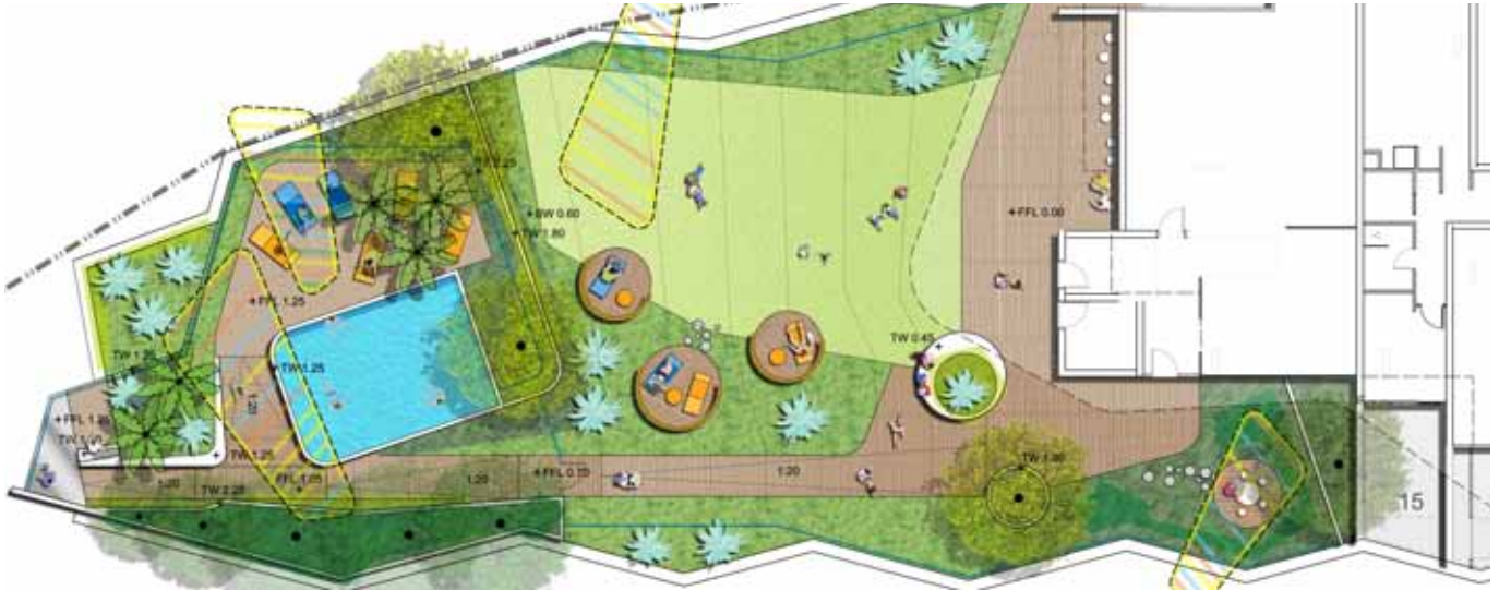
Level 3 private communal area

A Turner Architects building required a private communal area on level 3 and an outdoor dining facility on level 6 that can cater to 3 separate large groups.