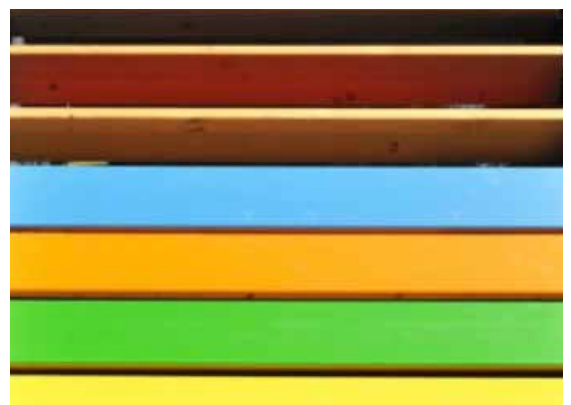
Coloured timber elements to shade pergolas